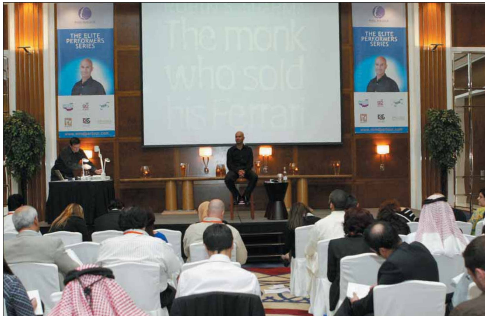
■ The author says he quit his career as a lawyer because he felt he was working for all the wrong reasons and therefore decided to put his new ideas down on paper

"I was unhappy as a lawyer. I had chosen a profession for all the wrong reasons – to be success-